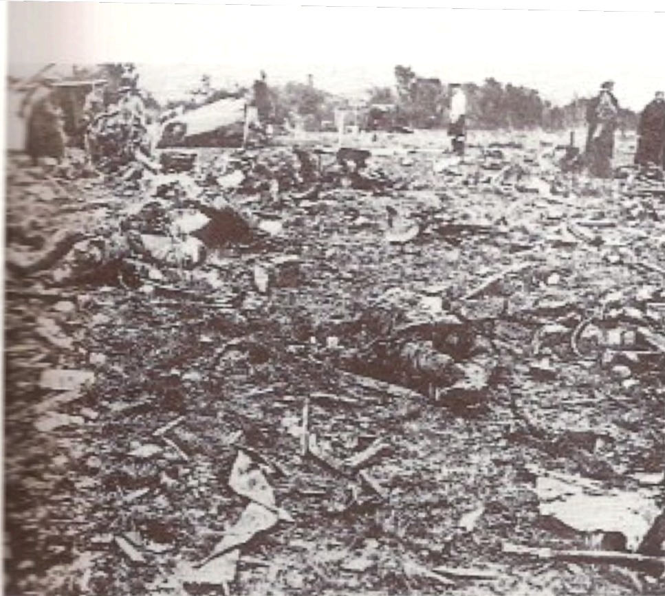
2. The grisly scene of scattered wreckage and bodies of German airmen after a Dornier 217 had crashed at Fairlight on 4th January 1943.

January 4 A Dornier 217, minelaying in Rye Bay, crashes into Firehills, Fairlight, causing extensive damage. The crew of four are killed.